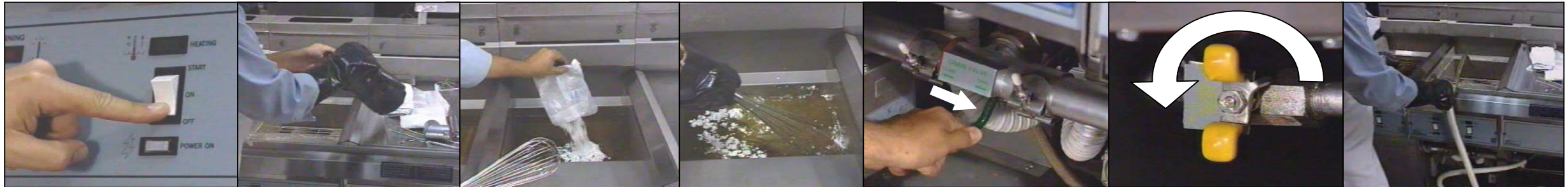
Turn the fryer off.