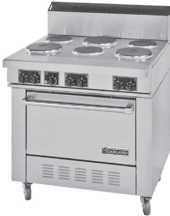
Model SU686 (shown with optional casters)

Product Name: S686 Sentry Series 36" Medium Duty Electric Restaurant Range