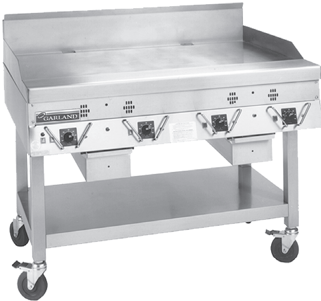
Model ECG-48R (Shown on optional stand)