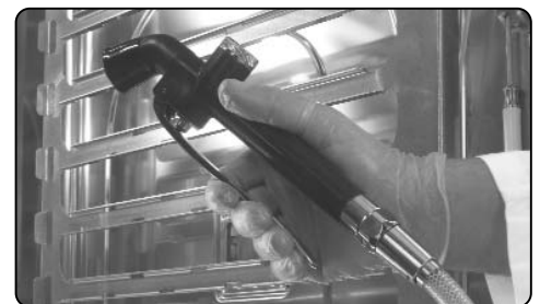
Rinse oven thoroughly with hand shower