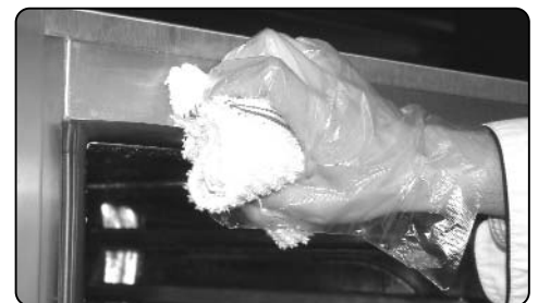
Clean door seal