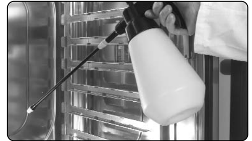
Spray oven with CONVOClean cleaner