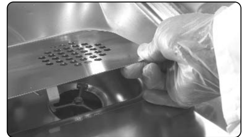
Remove and rinse drain trough with hand shower