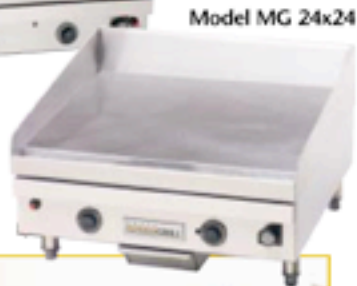
Model MG 24x24

The latest Anets GoldenGRILL SG-LD and MG-LD models feature an exclusive stainless steel side grease drawer that runs the entire depth of the grill plate. Grease and by-product are scraped right into the drawer for fast, convenient cleanup. It's easy to remove, and because it's open and highly visible, grease overflow can be virtually eliminated.