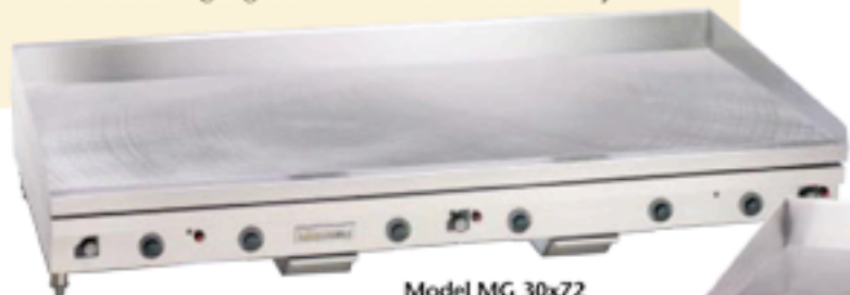
Model MG 30x72

You know you can find an Anets GoldenGRILL Series grill that meets your needs because Anets offers the most extensive line of gas grills in the foodservice industry.