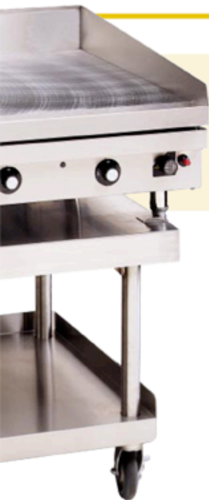
Model SG 24x48 Shown With Optional Heavy-Duty Stainless Steel Stand, Undershelf and Casters